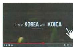
<KOICA SP Introduction Video>

Please ensure that applicants who have passed the local interview* for the 2025-1 KOICA Scholarship Program are not eligible to apply for the 2025-2 KOICA Scholarship Program. *conducted by the KOICA Overseas Office