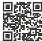
Online Session (20th May) Registration Form