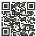
Program Information KOICA Cambodia